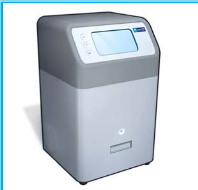
Illustration of the commercial instrument

INO has developed a biosensor able to fill various detection and diagnostic needs for the medical, military, food, and environmental industries. INO's biosensor is a compact, low-cost protein microarray system that is based on LED illumination and able to identify and quantify multiple microbial pathogens simultaneously. The system is very attractive as a technology platform for rapid, simple, and low-cost screening of multiple microbial pathogens in foods in a single test. INO's prototype is easily adapted to other applications based on bacteria detection and quantification.