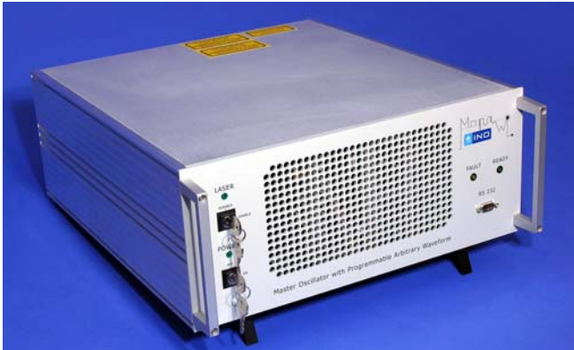
Pulse fiber laser oscillator including a 40 watts pump block

INO is a world-class center of expertise in industrial applications for optics and photonics and is a world leading technology developer and provider of pulsed fiber laser oscillator platform programmable pulse shapes in the nanosecond regime.